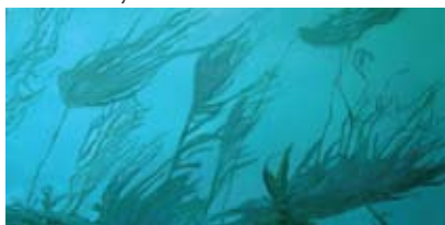
Sea Surge in the Kelp Forest, 24"x48"

www.UnderwaterPaintings.com 707 328-5281