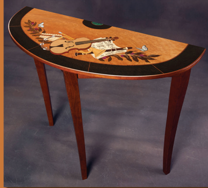
Hudson River Inlay